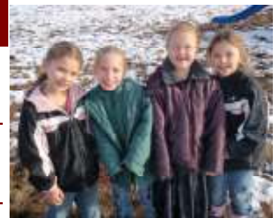
Smiling faces from our Division One class.