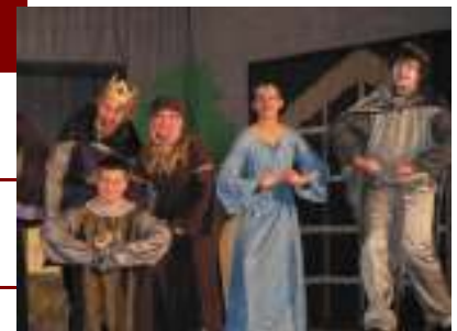
Our Missoula Children's Theatre presentation of King Arthur's Quest featured some colorful characters.