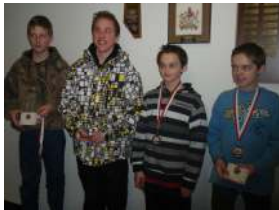
4-9 Curling Champions