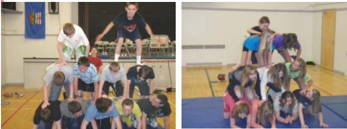
Division Three's work together to build great things.

Wow, the first month of 2011 is already over! During January the division two class began reading Number the Stars , a historical fiction novel based on Denmark during WWII. We have written similes and continued to work on good sentence structure as well as cursive writing. In math we finished up our unit on division and have begun to work on measurement. We strive to improve our basic facts through daily Mad Minutes. We continue to work our way through Alberta in social studies finishing the parkland region this month and beginning the boreal forest region.