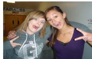
Silly, yet peaceful.