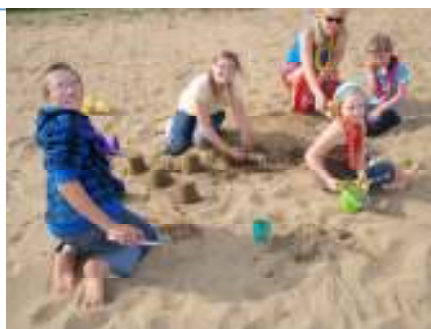
Students "dig in" during beach day.

As we have completed our first month, it is exciting to consider all the learning that has taken place. The level one's are well on their way to understanding the routine of school life. The level two and three students have worked hard on spelling, understanding phonetic rules and applying them in our reading and writing. We have had fun in math looking at number concepts, probability and even some graphing! During our integrated studies time, we have been studying about insects. These amazing creatures are truly fun to learn about. We invite everyone to come and look at our insect art. We look forward to lots more fun and learning in October.