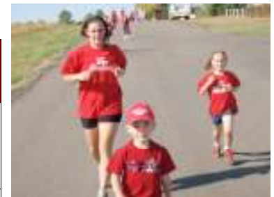
Schuler students (and staff) are amazing!

The student council would like to thank everyone for their participation in Red Day and Beach Day. Stay tuned for details on our Halloween activities.